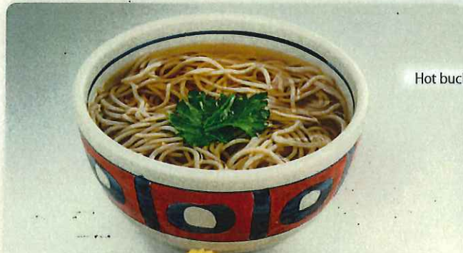
Hot buckwheat noodles